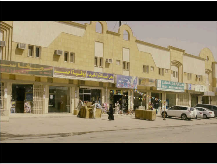
Fig. 9: A toy shop in Wadjda’s neighborhood offers the bicycle she discovered on her way from school.

After a pre-credits prologue inside her school establishes that Wadjda stands out among her peers, two subsequent scenes introduce her home and the conflict she faces there between her parents. In the first scene, she helps her mother to get ready for work and defends her against the driver, who complains about the regular delay. As Wadjda leaves the house to walk to school in the second scene, her father arrives wearing a car mechanic outfit. There are no further details about the father’s occupation throughout the film, as he is not present very often. The home, however, suggests that both parents have modest incomes. Happy to see her father, Wadjda indicates that he had not visited their house for an entire week. Later, viewers find out that Wadjda’s father is looking for a second wife, since her mother can no longer bear children. As she parts with her father, Wadjda encounters her friend Abdullah, who rides his bike to school with a group of other boys. Abdullah’s teasing results in Wadjda’s idea that she should challenge him in a race, and this idea prompts her desire to possess a bicycle.