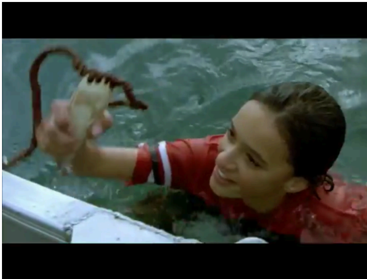
Fig. 5: In order to find his successor among the boys he has trained, Koro asks them to dive for his whale-tooth necklace. Paikea is the one to retrieve it in Koro's absence.

into the sea during a final test for the boys, among whom he hopes to find the next leader. Pai recovers this necklace in Koro's absence (Figure 5). Her independence at riding the bicycle foreshadows her own final test, the riding of a whale. While not a major change to Ihimaera's storyline, the use of the bicycle symbol in the film grants Caro the nod to De Sica, as well as to Susan B. Anthony. While the importance of the bicycle as symbol is implicit in Whale Rider , the following section discusses an example of a film in which the basic transportation tool takes centre stage.