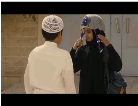
Fig. 12: Abdullah's gift of the helmet expresses his belief in her goal to own a bicycle, but also confirms the stereotype of the male protector.

Ms. Hessa, the rigid and potentially hypocritical school principal, favours Wadjda upon her progress with competition preparations.