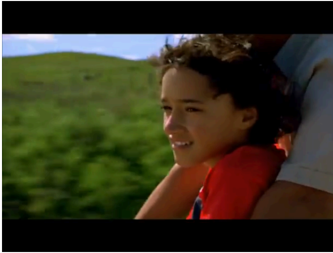
Fig. 1: During the first half of the film, the grandfather picks Paikea up from school on his bicycle.