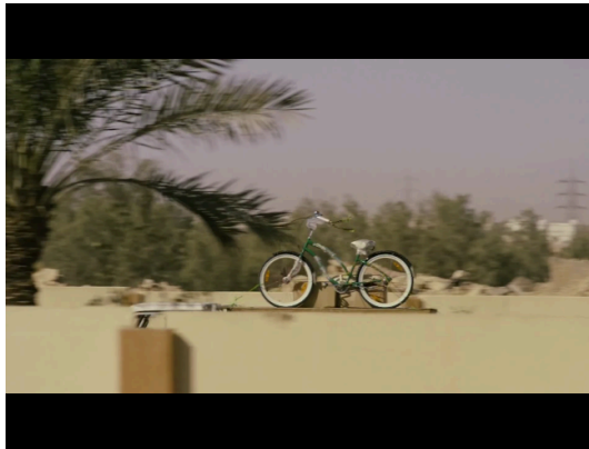
Fig. 7: On her way home from school, Wadjda spots the green bicycle attached to the roof of a moving vehicle.

to buy it (Figure 10). This scene introduces the one special, incidentally green, bicycle whose possession Wadjda pursues with the same determination that guides Paikea's struggle to assert herself against her grandfather. The initial wish to own a bicycle, however, originates in Wadjda's friendship with her neighbour Abdullah (Figures 11 and 12).