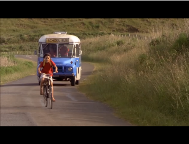
Fig. 6: On her own, Paieka rides the bicycle fast enough to pass the school bus.