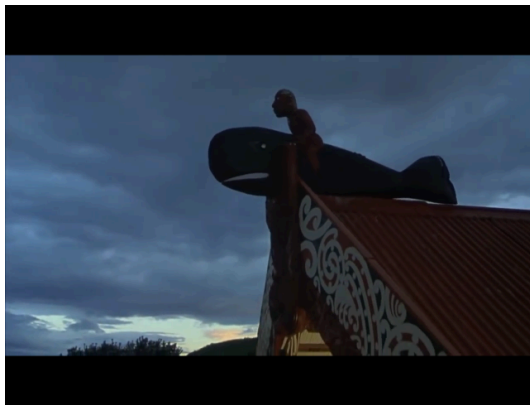
Fig. 3: This wooden sculpture depicts the mythological ancestor Paieka, the Whale Rider.