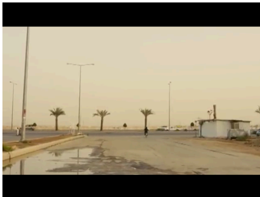
Fig. 14: This extreme long shot underlines Wadjda's final achievement to own a bicycle and to challenge her friend to the anticipated race.

On-location filming depends on filming permits in the Gulf countries. It thus stipulates an acceptance of given production codes. The decision to film on location, then, emphasizes Al Mansour's aim to touch viewers "on a very basic level" (Garcia). The film never pretended to function as "revolutionary art," which Al Haydar mistak-