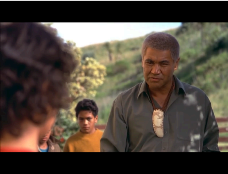
Fig. 4: The grandfather wears the whale-tooth necklace during his practice with the boys.

During the scenes in which Paikea shares Koro's bicycle, she often holds on to his whale tooth necklace (Figures 2 and 4). This gesture expresses her affinity as much as it foreshadows their proximity in lineage. Although the grandfather refuses to teach the girl traditional skills, such as how to use a taiaha in Māori martial art, his legacy as leader seems to transfer to his granddaughter via the whale tooth, at least metaphorically. When Paikea's visiting father invites her to join him abroad, Paikea delays the departure by requesting an extra round on Koro's bicycle. This scene marks the last time Koro grants her the privilege of sharing his bicycle. When Pai, finding her bond with the whales during the airport ride, decides not to leave with her father after all, Koro no longer picks her up from school. A bicycle next appears in the film when Paikea rides on her own. Behind Koro's back, she has pursued her physical education, which shows when she passes the school bus by herself, pedalling at record speed (Figure 6). It also shows when she dives for the whale tooth necklace Koro threw