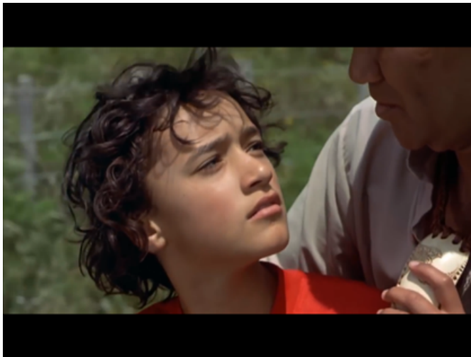
Fig. 2: This close-up shows Paikea holding on to Koro's whale-tooth necklace.